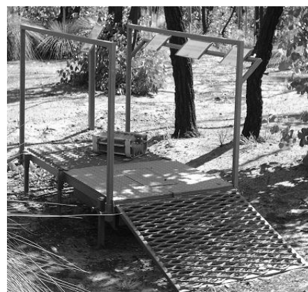
Boot cleaning station at Brisbane Ranges National Park