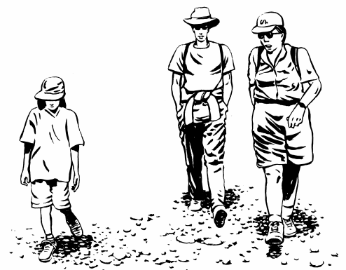
Adults and child walking ©RA

This 3 km circuit walk begins on Arthurs Seat Rd and directs park users to a constructed boardwalk which loops around the beautifully coloured dam.