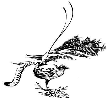
Superb Lyrebird

As you pass over the bridges, a symphony of frog calls can often be heard echoing from the protected pools along the river.