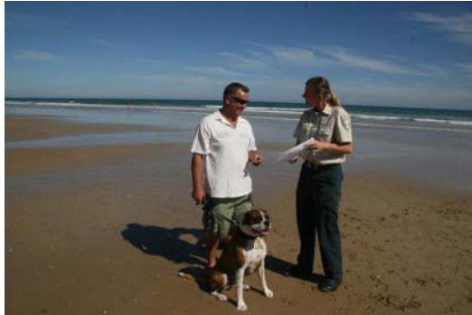
Hanging out with your dog in the park can be good for your mind, body and soul.

Many residents and visitors to the Otways region enjoy recreation activities with dogs. This includes having their dogs with them while they go walking, camping, horse riding, cycling, fishing and picnicking.