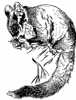
Sugar Glider

At night you may catch a glimpse of a beautiful Sugar Glider gliding from tree to tree. Ringtail Possums feed on eucalyptus leaves and flowers. Or you might spot the Common Brush-Tail Possum.