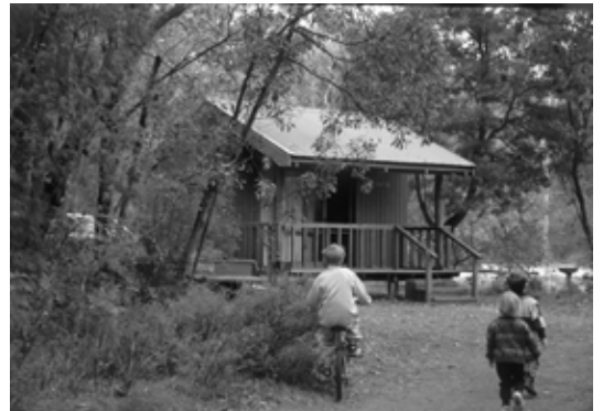
Princess Margaret Rose Cave – cabins

Sixty kilometres of the river flows through the park, with one section displaying 15 kilometre long limestone gorge with 50 metre high cliffs.