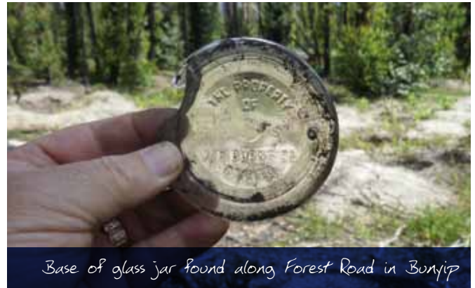
Base of glass jar found along Forest Road in Bunyip

A Cultural Heritage Management Plan for the Lawson Falls Picnic Ground at Bunyip State Park has been approved by Aboriginal Affairs Victoria. The plan was a necessary step in the reconstruction of Lawsons Falls to a new and improved design needed to meet future demands. The new facilities will be constructed over spring.