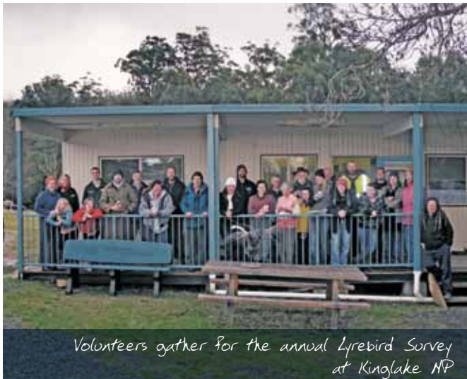
Volunteers gather for the annual Lyrebird Survey at Kinglake NP

Male lyrebirds call during winter to potential mates. At 7am their calls were heard at all survey sites. The survey was conducted at Masons Falls, Wombelano Falls and Watsons Creek Track. Three lyrebirds were sighted at each site and one volunteer was lucky enough to witness a male lyrebird in full display.