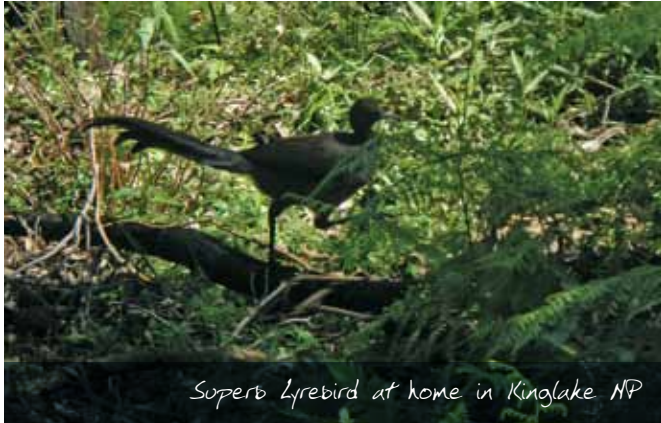
Superb Lyrebird at home in Kinglake NP

One of the most renowned of all Australian birds for its remarkable mimicry and splendid dancing displays is the Superb Lyrebird ( Menura novaehollandiae ). A recent survey has confirmed the lyrebird is still at home in Kinglake National Park.