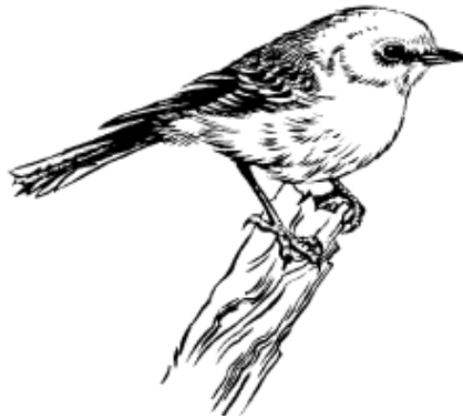
Eastern Yellow Robin

At an elevation of 1245 metres, Mt Donna Buang offers panoramic views over Melbourne, the Yarra Valley, Dandenong and Cathedral Ranges, Mount Baw Baw and the Alps. While on the mountain you can take in a rainforest experience and even walk through the tree tops at the spectacular Rainforest Gallery. In winter the mountain offers the closest and most accessible snow to Melbourne for family snow-play and tobogganing.