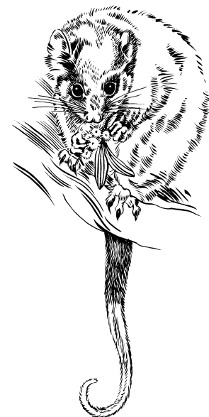
Common Ringtail Possum

The Dandenong Ranges National park was proclaimed in December 1987. It consists of the amalgamation of Fern Tree Gully National Park, Sherbrooke Forest and Doongalla Estate along with the Upwey and Sassafras land corridors. In 1997, the Olinda State forest was formally added to the National Park along with the Montrose Reserve.