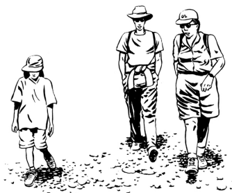
Adults and child walking

Areas of higher elevation such as Trig Point and The Lookout provide expansive views of the Dandenong Ranges, Port Phillip Bay and Frankston.