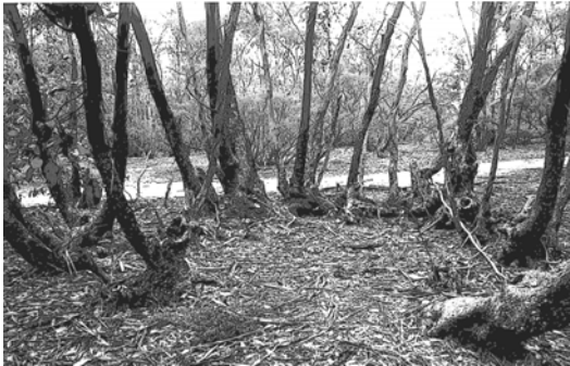
Over generations the lignotuber from one mallee can spread into a large mallee ring indicating great age. The lignotuber is a central woody lump that several stems grow from giving the mallee its distinctive form.

With the opportunity to view Mallee vegetation in close proximity to Melbourne, this 600 hectare reserve provides a unique experience for visitors to enjoy. Plants typical of arid landscapes, small-scale creek escarpments and classification by the National Trust make the reserve a fantastic retreat for bushwalkers and bird observers.