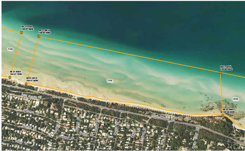
Tyrone East Mooring Set Aside Port Phillip

230602016 Coordinate System: GCS WGS 1984 Datum: WGS 1984