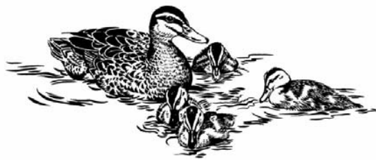
Black duck with young

Popular with visitors and wildlife, St Georges Lake was once a mining dam used to supply water to the Creswick State Battery for crushing quartz. Today it is a popular summer base for water activities. Free gas barbecues and toilets are provided in the main picnic area. Wood barbecues are also provided in the eastern picnic area on the inlet creek. Dogs are permitted at St Georges Lake, but they must be on a lead. There is no camping at the lake and power boats are not permitted .