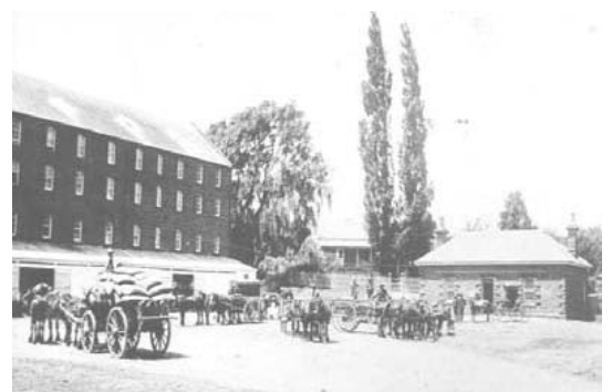
The Mill building is open on the first Sunday of the month 12 - 4pm.

On the banks of Birch's Creek at Smeaton, the bluestone flour mill and grounds are like a scene from a postcard. Anderson's Mill was built and operated by the Anderson family from 1862 to 1959. Picnic by the creek and stroll around the impressive ground any day.