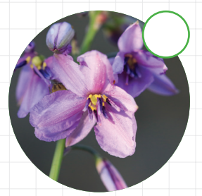
CHOCOLATE OR VANILLA LILY