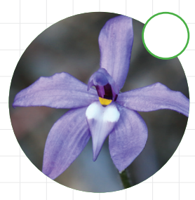
ORCHID (PINK OR PURPLE)