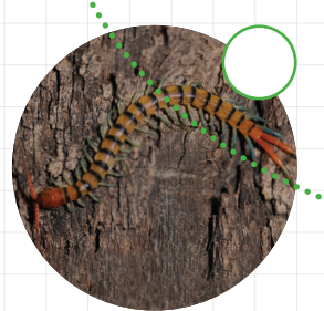
CENTIPEDE / MILLIPEDE