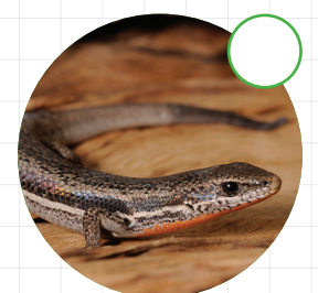
SKINK, BLUE TONGUE OR STUMPY LIZARD