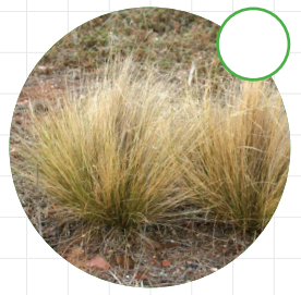
TUSSOCK GRASS (SHORT OR TALL, GROWS IN CLUMPS)