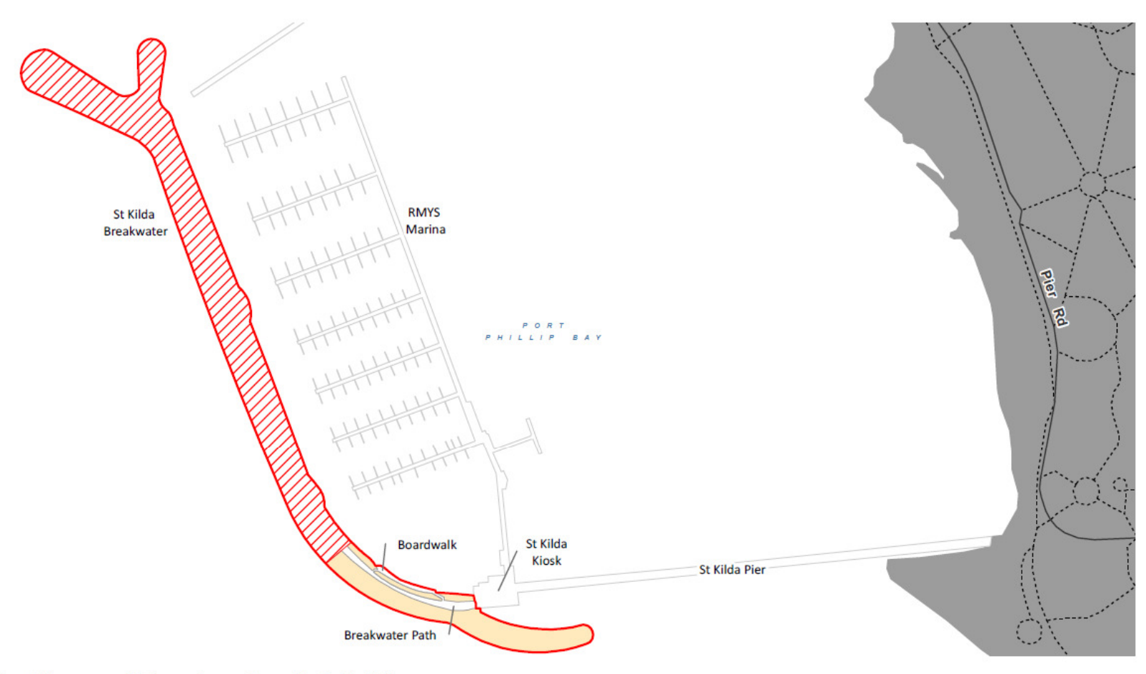
Attachment 1 - St Kilda Pier and Breakwater