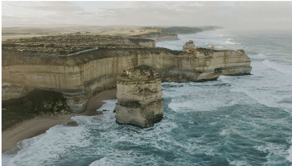
The Castle Rock promontory is the sole location in the precinct to view all stacks