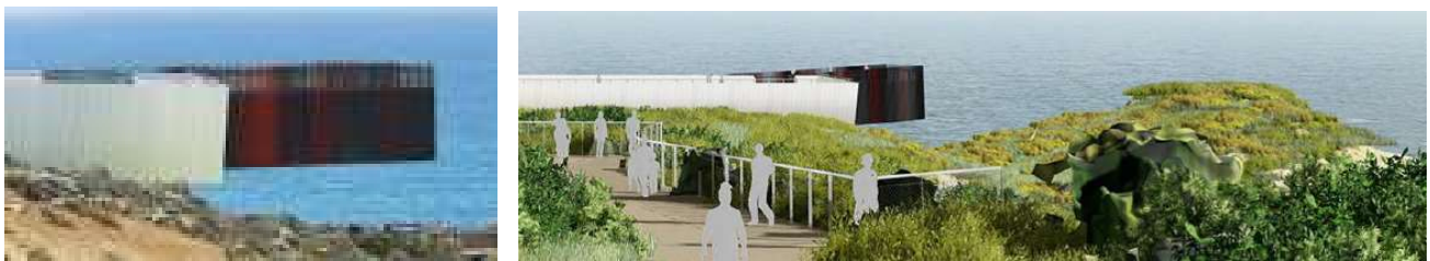
The variations to the greater extent of vegetation under the structure, and seaward rehabilitating the areas of removed infrastructure