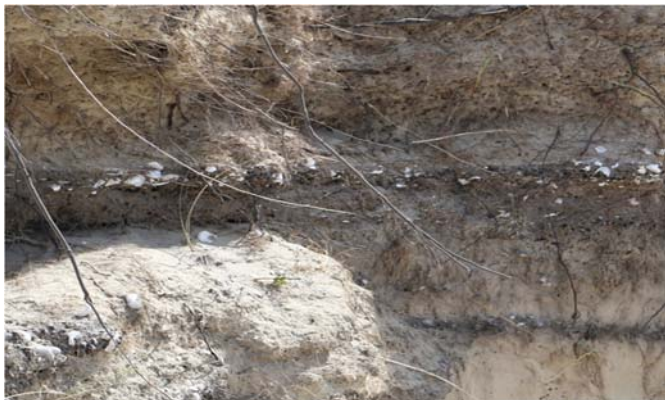
Aboriginal heritage sites are a key reason for protecting the dunes

Early European accounts noted permanent villages nearby, and large inter-tribal gatherings at Tarerer (Kellys Swamp) to celebrate and share in the bounty of the sea.