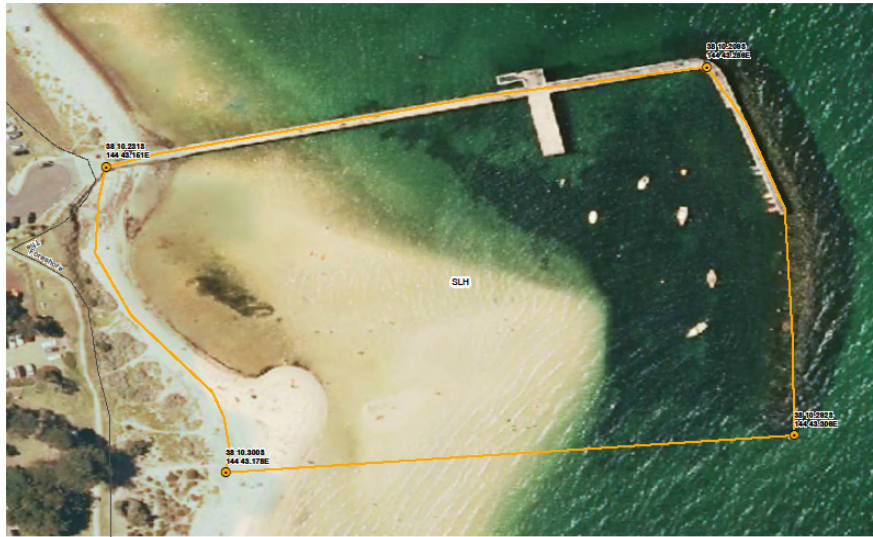
St Leonards Harbour Mooring Set Aside Port Phillip

22062016 Coordinate System: GCS WGS 1984 Datum: WGS 1984