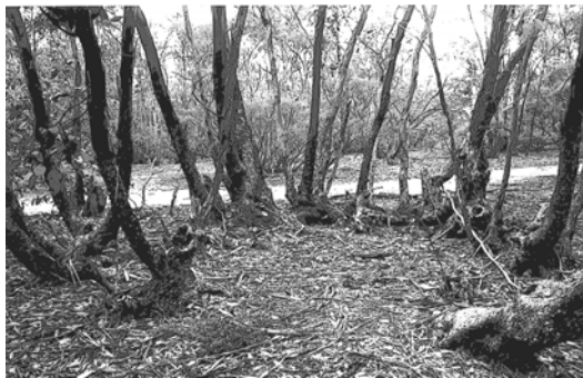
Over generations the lignotuber from one mallee can spread into a large mallee ring indicating great age. The lignotuber is a central woody lump that several stems grow from giving the mallee its distinctive form.

With the opportunity to view Mallee vegetation in close proximity to Melbourne, this 600 hectare reserve provides a unique experience for visitors to enjoy. Plants typical of arid landscapes, small-scale creek escarpments and classification by the National Trust make the reserve a fantastic retreat for bushwalkers and bird observers.