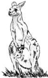
Kangaroo and joey © MT