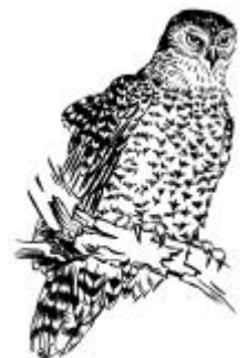
Powerful Owl

Large native mammals such as Eastern Grey Kangaroos, Wombats and Koalas are slowly increasing in numbers as the revegetation programs extend their habitat from Warrandyte. Numbers of smaller mammals such as antechinuses and possums are also increasing which, in turn, is attracting predators like the Powerful Owls and the Grey Goshawks.